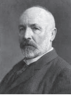
Figure 1. Georg Cantor (1845–1918).