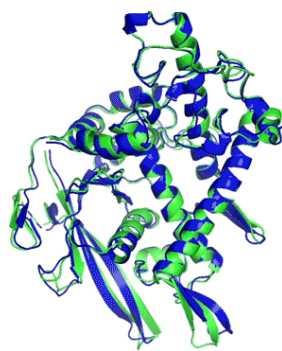
T1037 / 6vr4 90.7 GDT (RNA polymerase domain)